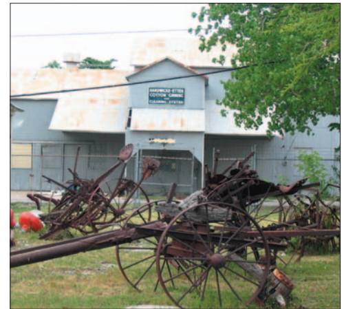
Downtown Rowlett Cotton Gin Near Proposed Downtown Station

A Community Work Group will be established to provide targeted citizen input to the environmental impact analysis. It will be comprised of representatives of homeowner associations, property owners, business leaders, and others; working together to stay informed about the project and to inform the Project Team about issues that affect them.