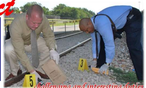
challenging and interesting duties