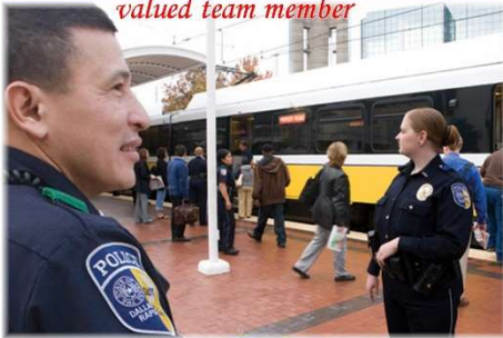
valued team member